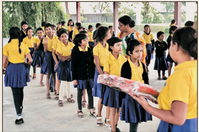
PLC students patiently waiting for their turn