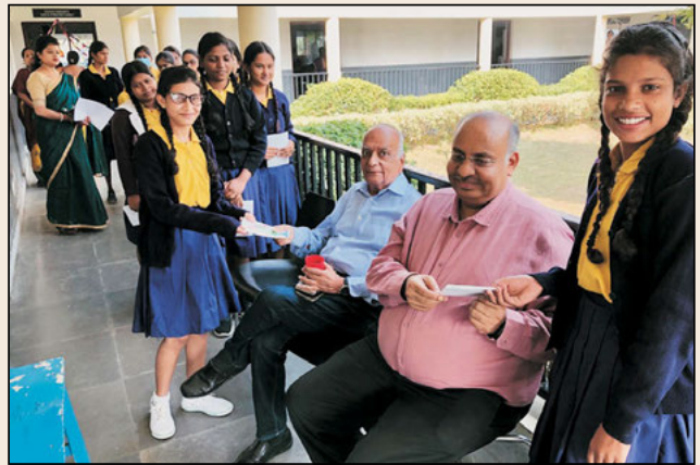
Amazing drawings by the PLC Students-Kudos to them