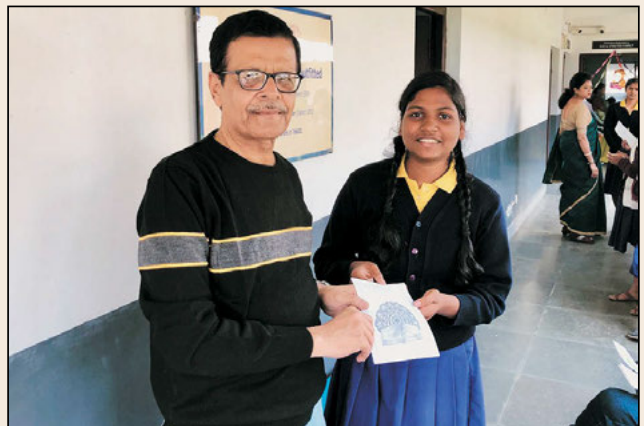
Editor of Metro Voice got special treatment-fantastic black & white drawing