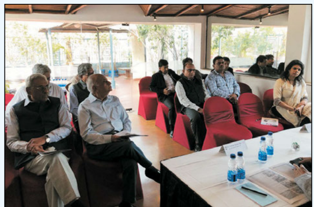
Another view of members