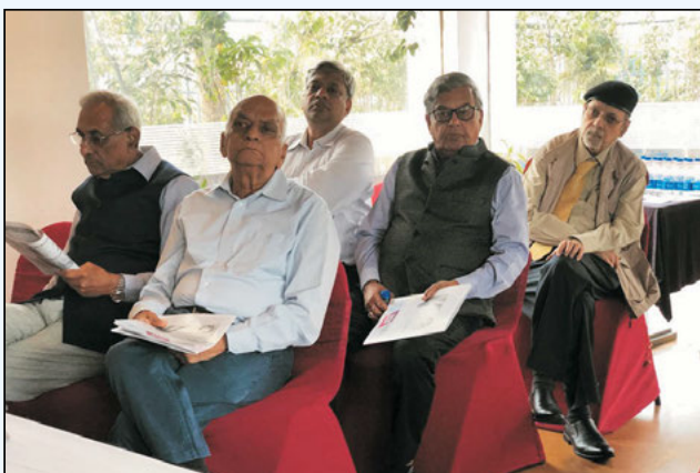
A view of members