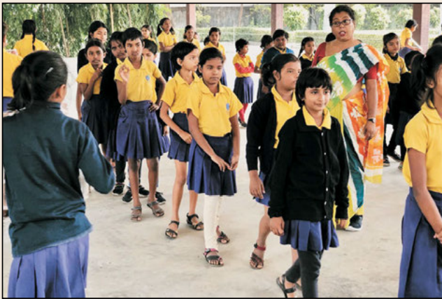
Time to rejoice for PLC Students