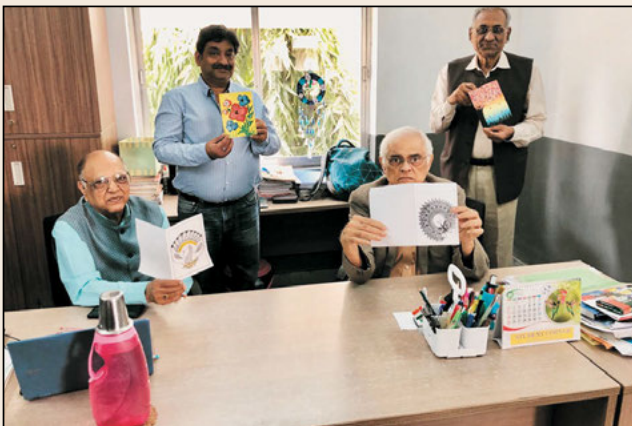
What a pleasant gesture from PLC students handing over to each Metropolitans hand made drawings